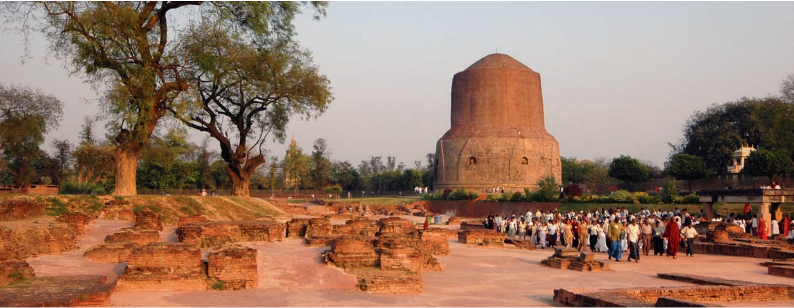
The monument at Deer Park in Sarnath, marking the Buddha's first sermon presenting the fundamental truths he had realized.

The four seals are meant to be understood literally, not metaphorically or mystically, but