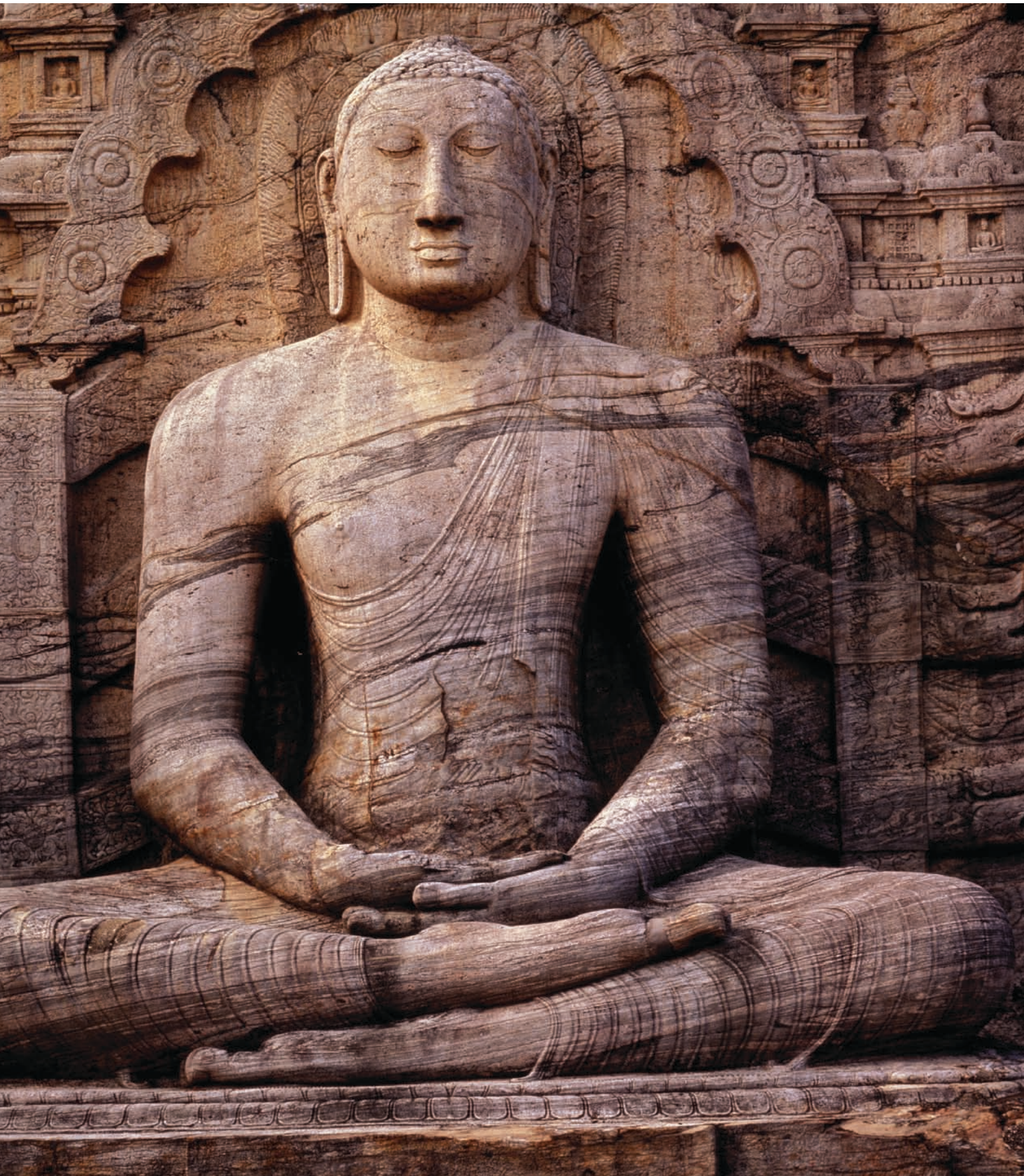
Gal Vihare, Sri Lanka