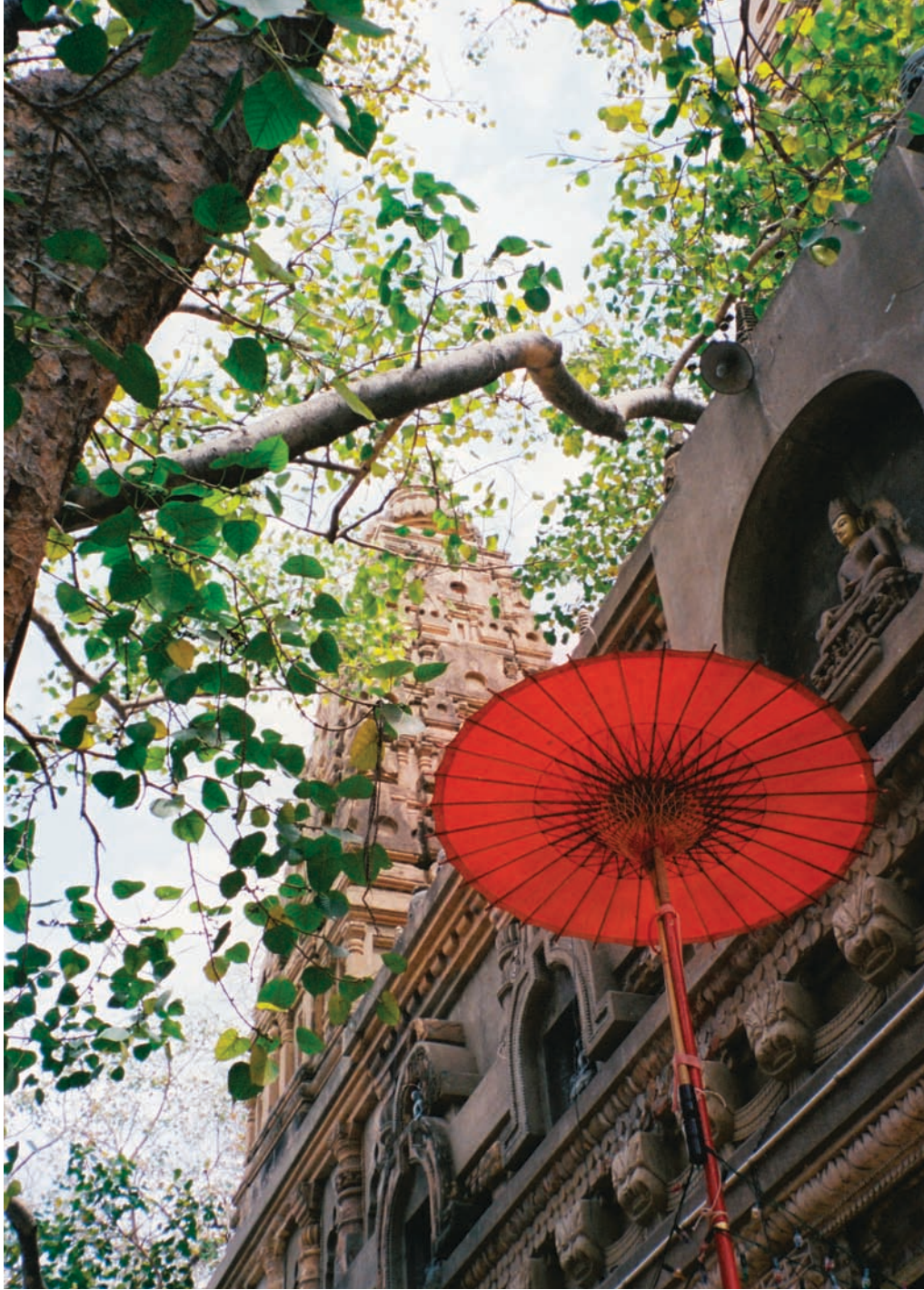
The Mahabodhi Temple in Bodhgaya, India, commemorating the Buddha's enlightenment under the Bodhi tree and discovery of the four seals.

not wear robes or shave your head, you may eat meat and idolize Eminem and Paris Hilton. That doesn't mean you cannot be a Buddhist. In order to be a Buddhist, you must accept that all compounded phenomena are impermanent, all emotions are pain, all things have no inherent existence, and enlightenment is beyond concepts.